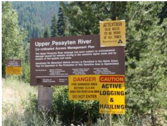
Opposite side of Hwy 3.

From Hwy #3, driving 18 km east from Manning Park Lodge, watch for FSR after the East Gate and after the Esso gas station. You can easily miss this road. (There is a FSR sign and day use area on the opposite side of the highway—Upper Pasayten River as shown below.)