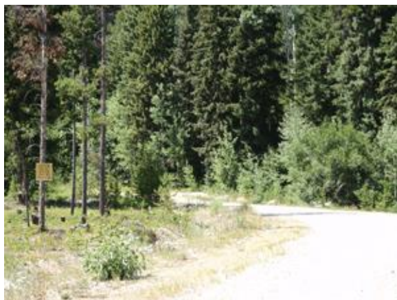
Bonnevier Aid Station location at Hwy 3.

On Eastgate FSR (unmarked), turn left and drive a few meters. Aid station will be here.