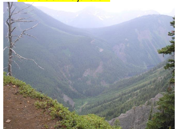
Junction of Skyline II and Skyline I.